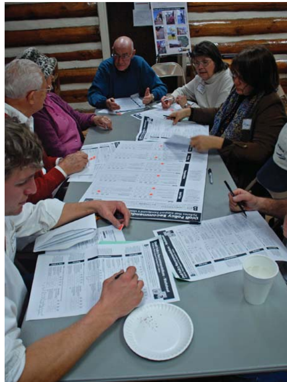
Figure 1.3 - Several hundred residents helped develop the comprehensive plan, through questionnaires, photographs, committee meetings, or as in the case of this image, community gatherings.

The State Legislature enacted the Local Land Use Planning Act in 1972. This act serves