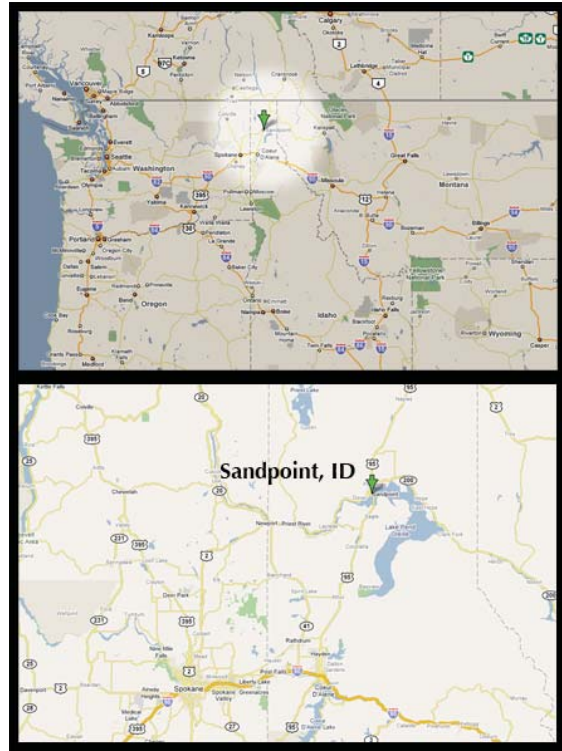
Figure 1.2 - Sandpoint, Idaho's location relative to the northwestern United States, and to major regional cities.

The City of Sandpoint (pop. 8,105) is situated in Bonner County on the banks of Lake Pend Oreille, about 60 miles south of the Canadian border. This plan's study area includes the entire City area and Area of City