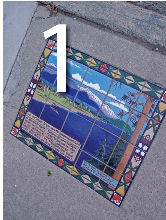
Figure 1.1 - Sandpoint's history extends many thousands of years into the past, when the Kalispel people first arrived and settled along the shores of Lake Pend Oreille.

This plan is intended to be a road map for the community to follow as they consider planning decisions both large and small; some the City can control, some facilitate. It reflects the changing social and economic landscape of the community, and based on forecasts and existing trends, anticipates civic needs 20 years into the future. It seeks to serve everyone, including life-long